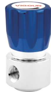
Hand wheel Switch